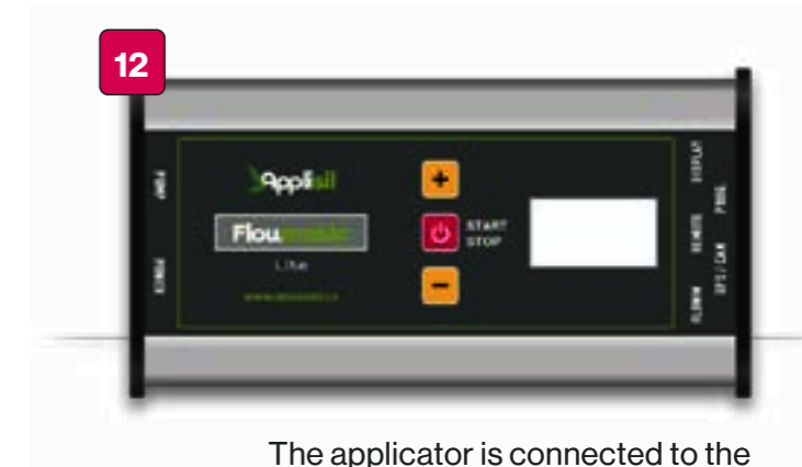
The applicator is connected to the Flowmatic Lite controller , which is part of the complete package.